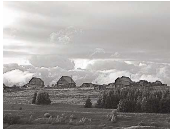
Dramatic sky at sunset over dachas on the Volga River

dramatic skies, the Russians have traditionally placed their political fortunes in the hands of powerful and aggressive leaders. Josef Stalin bragged in the 1950s that he was able to terrorize one out of every ten citizens. 2 The numbers of the intelligentsia executed in Russia in the 20th century, robbing the country and the world of brilliance in literature, drama, music, and dance, is astonishing. And the government still uses fear to control its people—in the past two years, more than thirty Russian journalists critical of the government have met an untimely, often cruel death, victims of apparent assassination.