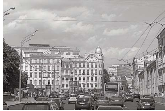
Trevskaya Prospekt in Moscow

During this time the schools multiplied and found success. In 2006 the central government invited schools and individual teachers to present their curriculum ideas in a nationwide contest.