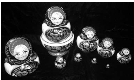
Matrushka nesting dolls

The expansive Russian countryside is rich in nature wisdom from the North. Matrushka dolls, an ancient fertility symbol, are found everywhere, as are stories of pagan rituals and atavistic festivals in the birch forests. These vast forests stretch endlessly, as do the broad steppes, and the sky is a panorama of dramatic changes. Simple dachas—summer homes or retreats—line the Volga River with richly carved wooden window frames, doors, and eaves. Most have not seen paint for at least forty years and are near collapse. They serve as a metaphor for life in general. The structure of Russia needs repair and care. The countryside is a picture of abject poverty. I met several people who were foraging in the forest for mushrooms and berries in order to survive. Many of the elderly receive only meager social services and beg on the streets for subsistence.