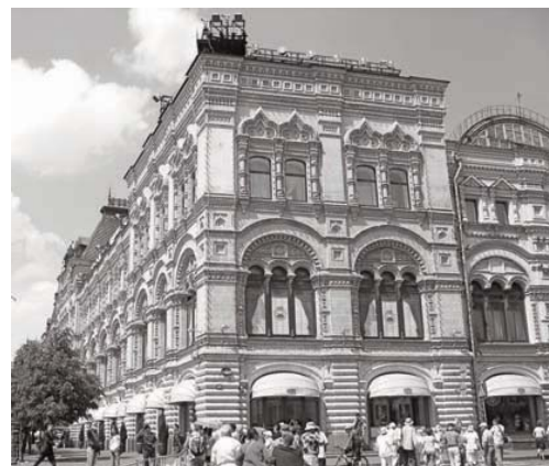
GUM Department Store at Red Square

On the other hand, St. Petersburg and Moscow are thriving and impressive cities, bustling with restoration and new construction. Moscow, a huge city with population of over 12.6 million residents, 3 suffers from congested, pot-hole-riddled roads and too much traffic. Delays are painfully long. Food in Moscow, currently the world's most expensive city, is a third more costly than in the United States; a modest hotel charges between $700 and $2,400 per night for a room. Marquee stores from Paris, Geneva, London, and New York line Arbat Street (the premier shopping avenue) and fill GUM, the massive department store next to Red Square. If you have money you can purchase anything, and most Muscovites