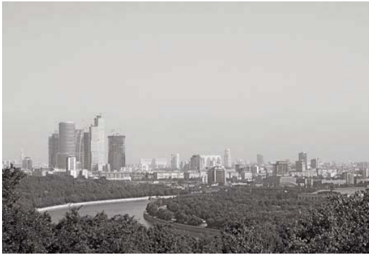
Moscow as seen from University Hill

appear to have ample resources, unlike their country cousins. There is a wide gap between the poor and the rich.