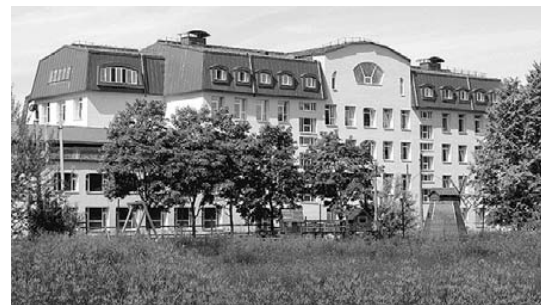
Waldorf school in St. Petersburg

During the 1990s, as the economy collapsed and expenses skyrocketed, the Waldorf schools entered a fight for survival. School 1060 had to decide if it wanted, like most independent schools in Russia, to become a private school with high tuition rates or become a state school. The school