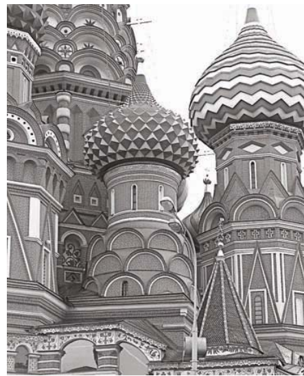
Details, St. Basil's Cathedral in Red Square, Moscow